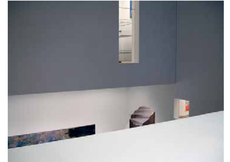
Fig. 1 Poster for MoMA in Hamburg: Louise Lawler , Kunstverein in Hamburg, April 16–July 3, 2005. Printed paper, 46¼ × 64 in. (118.7 × 162.6 cm)

In Heard Not Seen , a presentation of sound works at the Lower East Side gallery Orchard in 2006, several works could be experienced together: Lawler's poster for MoMA in Hamburg: Louise Lawler (2005, fig. 1) and Birdcalls (1972/1981); Adrian Piper's Aspects of the Liberal Dilemma (1978); and Andrea Fraser's Untitled (Audio) (2003/2004). 6 Fraser, a member of the gallery, decided to juxtapose Lawler's poster with Gertrude Stein's text "Matisse"